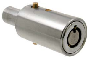
Product ID: 4339