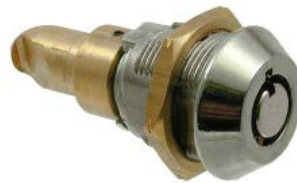
Product ID: 4333