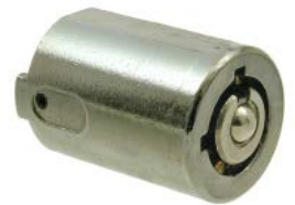
Product ID: 4376