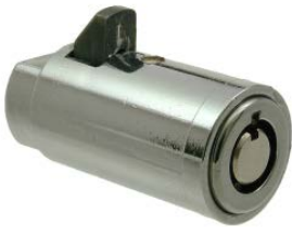
Product ID: 4302