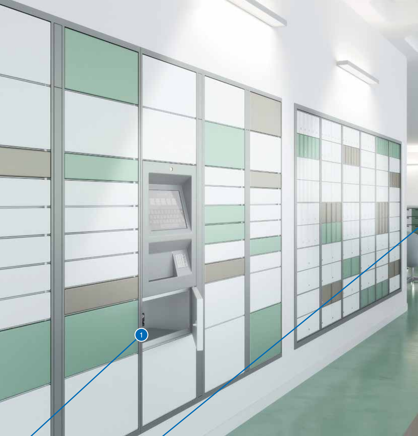
1. Electronic Latchlock